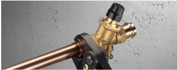
Model 2981.71 / 2987.72